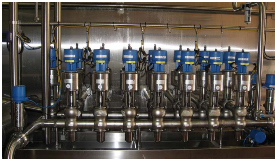
M.E. Engineering provides quality and cost effective services

M.E. Engineering is a privately owned company, with ownership by one of our practising senior process engineers.