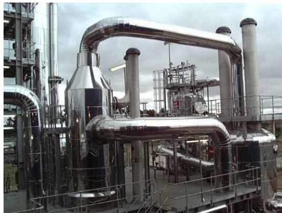
Site upgrades increase existing production

Existing operations can be enhanced by examining plant for changes that will improve productivity and/or flexibility