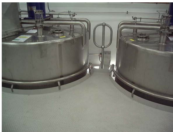
Site upgrades increase existing production

Existing operations can be enhanced by examining plant for changes that will improve productivity and/or flexibility