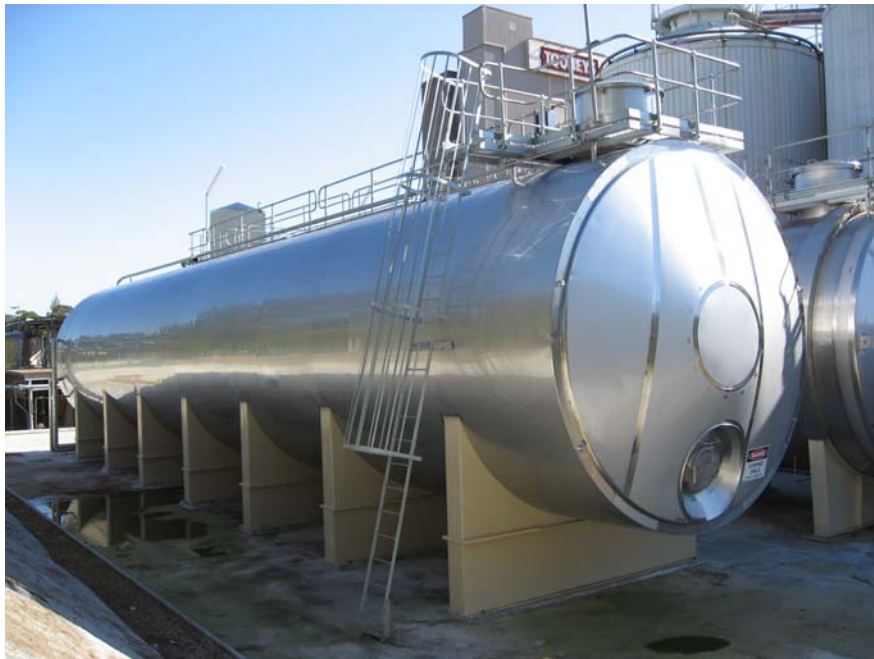
M.E. Engineering provides quality and cost effective services

M.E. Engineering is a privately owned company, with ownership by one of our practising senior process engineers.