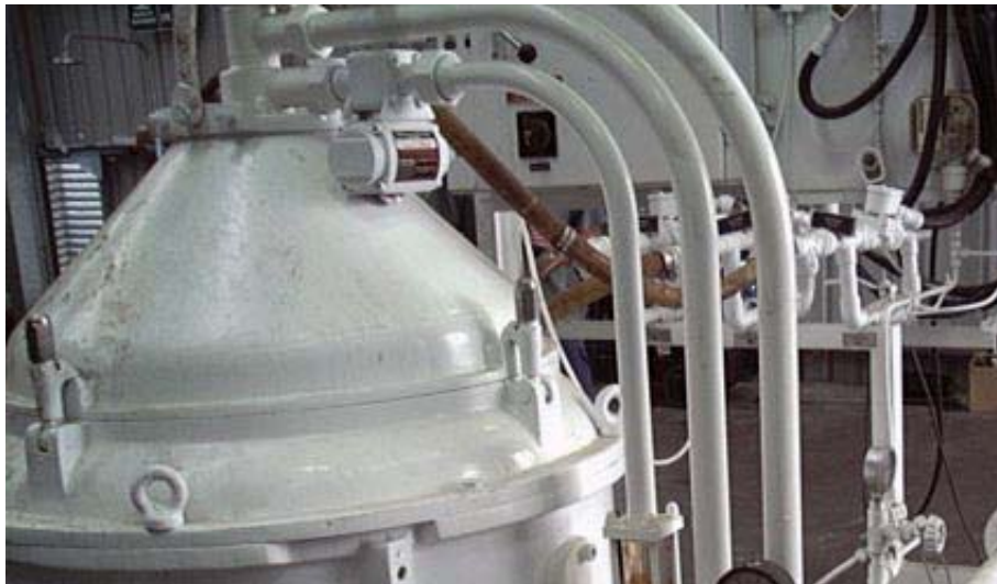
M.E. Engineering provides quality and cost effective services

M.E. Engineering is a privately owned company, with ownership by one of our practising senior process engineers.