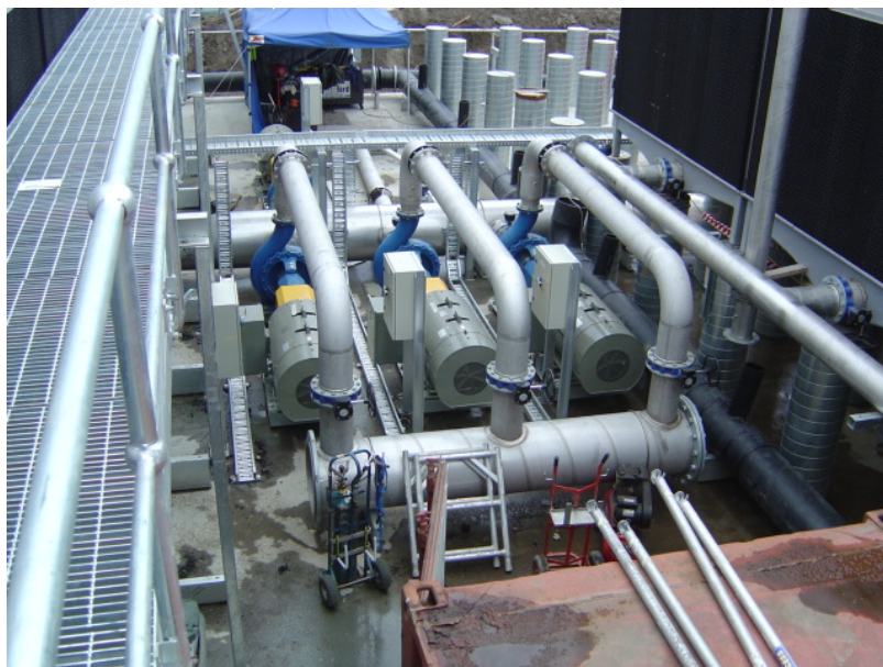
M.E. Engineering provides quality and cost effective services

M.E. Engineering is a privately owned company, with ownership by one of our practising senior process engineers.