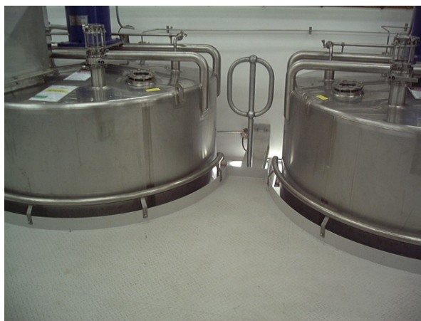
Site upgrades increase existing production

Existing operations can be enhanced by examining plant for changes that will improve productivity and/or flexibility