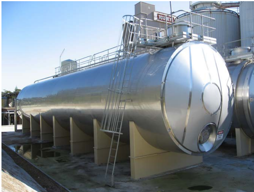
M.E. Engineering provides quality and cost effective services

M.E. Engineering is a privately owned company, with ownership by three of our practising senior engineers.