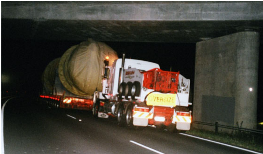
M.E. Engineering provides quality and cost effective services

M.E. Engineering is a privately owned company, with ownership by one of our practising senior process engineers.