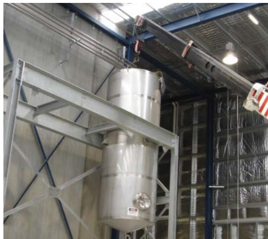
Site upgrades increase existing production

Preliminary cost and budget estimates, scope input and past experience are a valuable segment of feasibility studies. M.E. Engineering can work as part of the team examining project feasibility